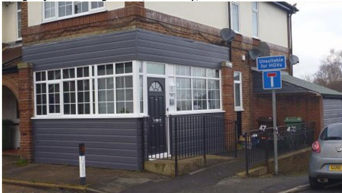
Image of 47 Hastings Road, February, 2021.

The old Ludlow Wall Letter Box below the small window still exists as of February, 2021.