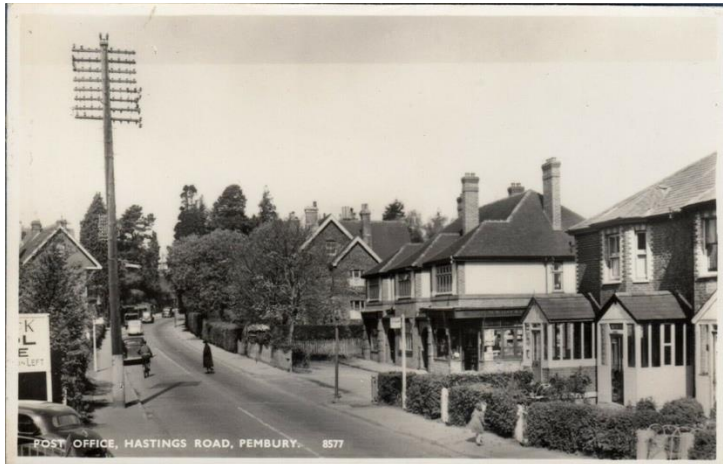
The image on the left shows Haywood Stores and is described as the Post Office, Hastings Road, Pembury.