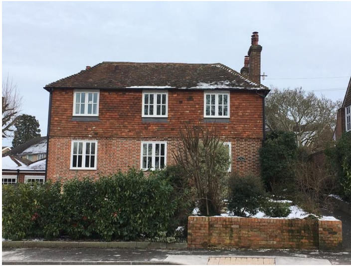
Image of 72 Lower Green Road, 'The Old Post Office', February 2021

Sadly, the Lower Green Post Office closed in 2005 and the building was converted to a house called "The Old Post Office" with the shop front demolished in circa 2010 and turned into a front garden. The pillar box was removed from next to the building. A pillar box exists on the pavement on the other side of the road at the top of Church Road but it is not known as of February, 2021 whether it is the same one that existed to the side of 72 Lower Green Road when the Post Office closed in 2005.